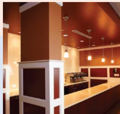
Concession area serves parishioners.

In addition to the ongoing event and facilities requests from the