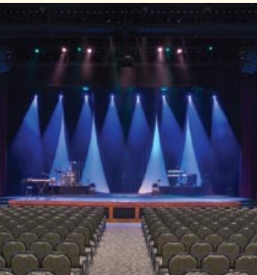
Conference center main room that seats 2,100 people.

Over the past year, the church has also orchestrated a number of special one-time events, including a "Hope for 100" Orphan Care emphasis featuring actor Jim Caviezel; a multi-day July 4th Freedom Celebration, with appearances by comedian Chonda Pierce, football players Colt McCoy and Luke McCown, and American Idol singer, Mandisa; the Green Acres Men's Breakfast of Champions, featuring Judge Ken Starr, president of Baylor University; and a four-day Missions Conference in November featuring 24 missionary families and speakers from around the world.