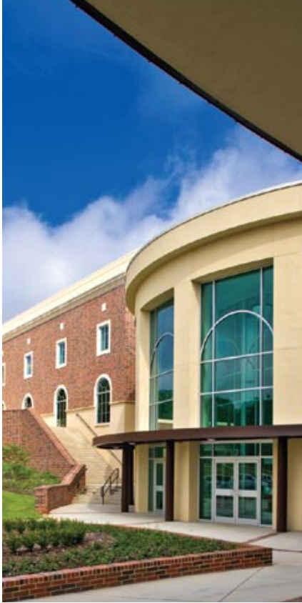
Entrance to the CrossWalk Conference Center.

and is divisible into three smaller sections for events of 350, 700 and 1,000 participants respectively. The lower garden level offers additional rooms for groups ranging in size from 25 to 150.