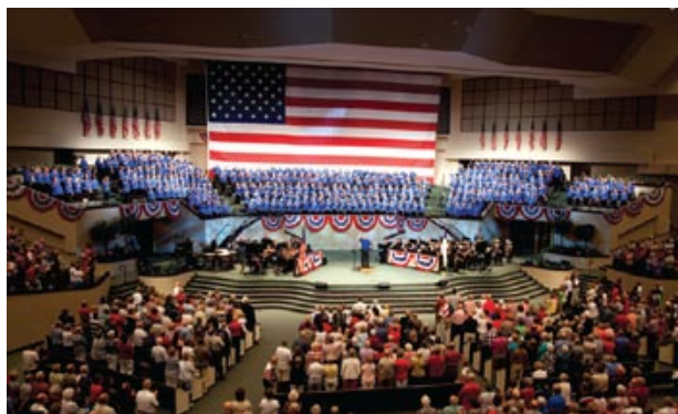
Scene from the church's annual "I Love America" musical celebration.